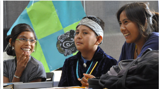
Students competing in a summer Math Camp "math wrangle"

Navajo Math Circles opens a window on the lives of several Navajo students who have participated in a lively collaboration with mathematicians and math educators since 2012. The students stay late after school and assemble over the summer to study mathematics, using a model called Math Circles. This notion of student-centered learning puts children in charge of exploring mathematics to their own joy and satisfaction, with potentially long-lasting results.