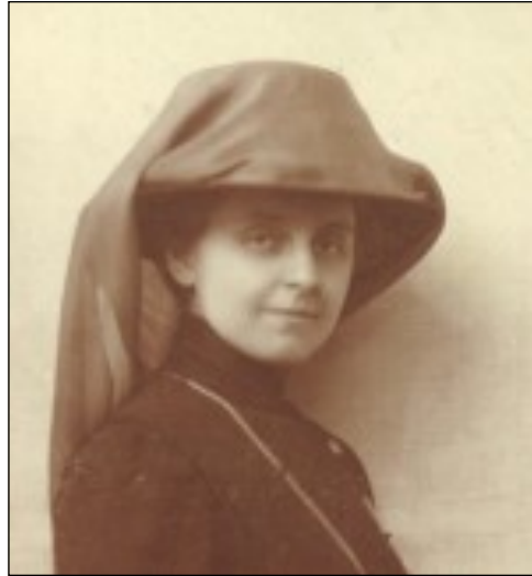
Sister Margaret Slachta, SSS (1884-1974) Sisters of Social Service