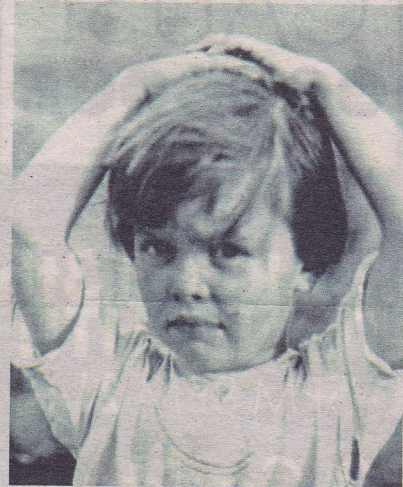
Julia Robinson and Hilbert's Tenth Problem